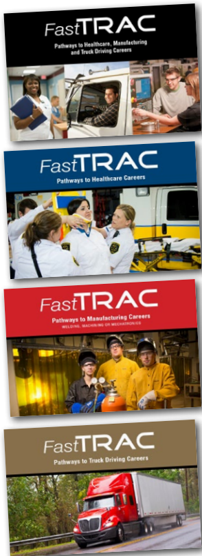
Social Media Ads