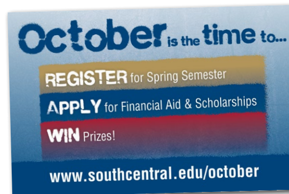
Social Media, Monitor Slide & Tabletents

Dedicated Landing Web Page www.southcentral.edu/october