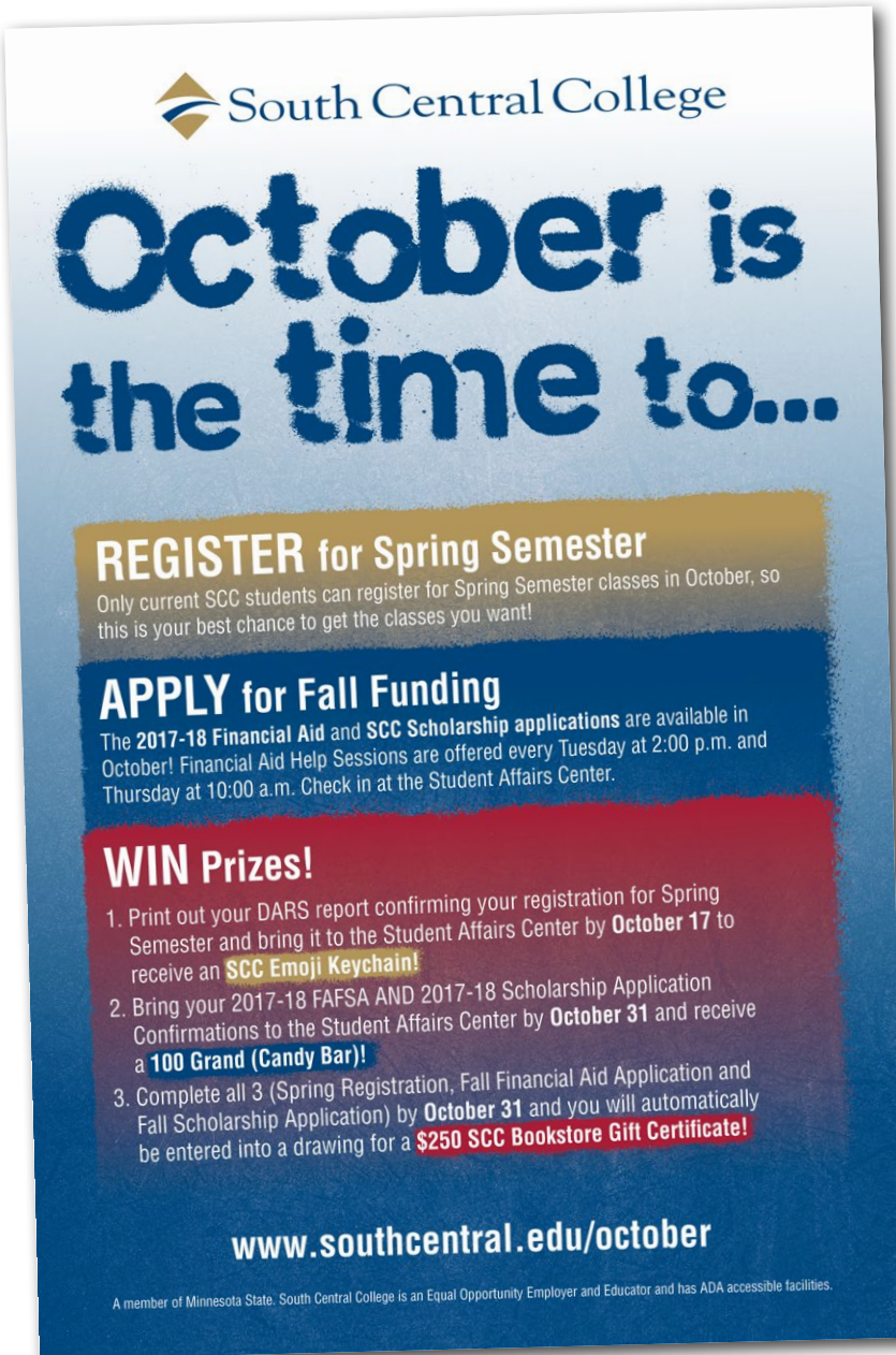
Handout and Large Window Display